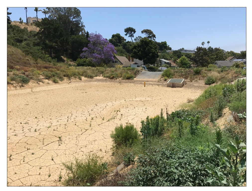
POST-PROJECT Photo Point 2: View south of detention basin location. (June 2, 2017)

APPENDIX A-2 Photo Point 2–Pre-Project Photograph and Post-Project Photograph Annual Monitoring Report for the ALTA La Jolla Drive Drainage Repair Project–Phase 2