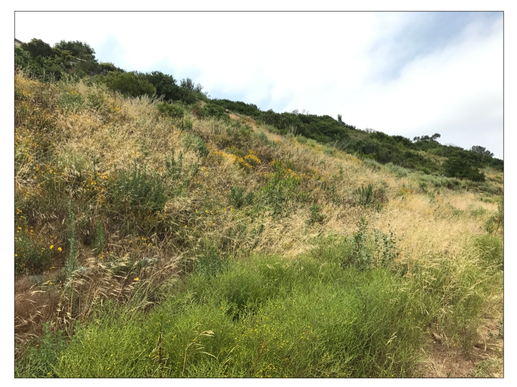
POST-PROJECT Photo Point 6: View looking southeast at eastern slope. (June 2, 2017)