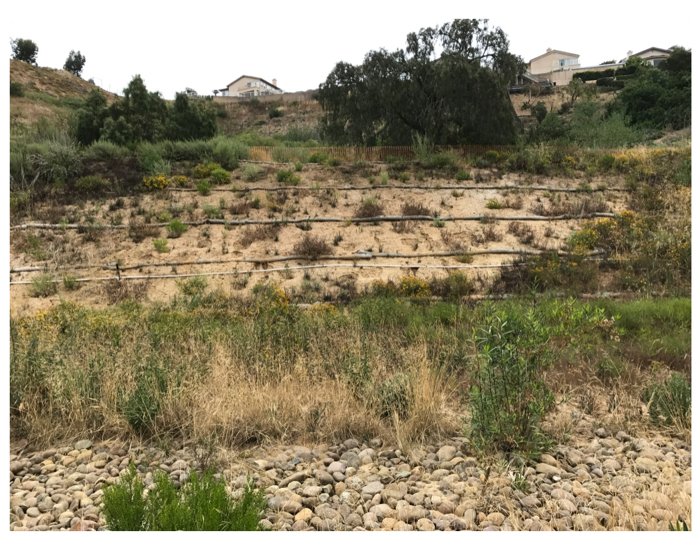
POST-PROJECT Photo Point 5: View looking east at eastern slope. (June 2, 2017)