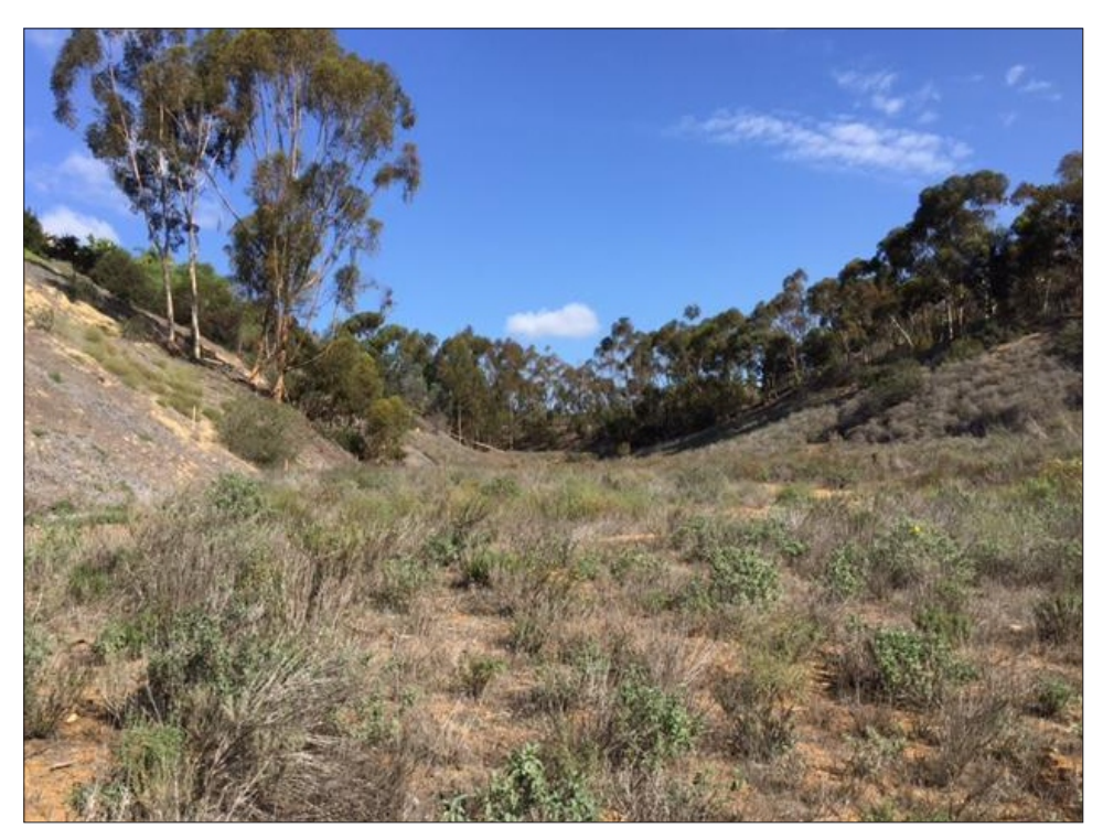
PRE-PROJECT Photo Point 1: View north at future energy dissipater location. (October 20, 2015)