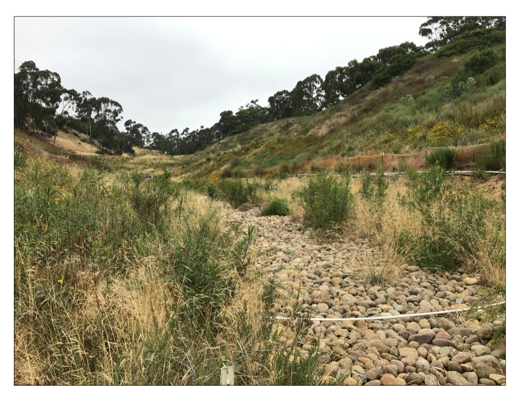
POST-PROJECT Photo Point 4: View north after removal of deep incision on eastern slope. (June 2, 2017)