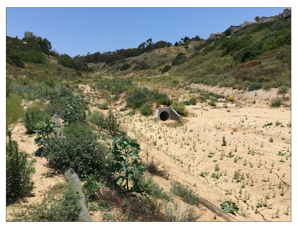
POST-PROJECT Photo Point 3: View northeast of outlet to detention basin location. (June 2, 2017)