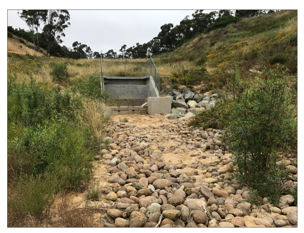
POST-PROJECT Photo Point 1: View north at energy dissipater location. (June 2, 2017)

APPENDIX A-1 Photo Point 1–Pre-Project Photograph and Post-Project Photograph Annual Monitoring Report for the ALTA La Jolla Drive Drainage Repair Project–Phase 2