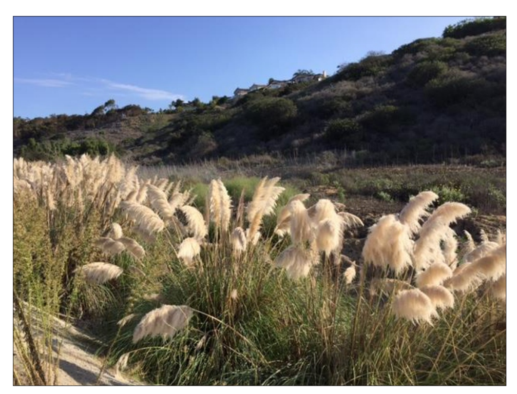
PRE-PROJECT Photo Point 3: View northeast of future outlet to detention basin location. (October 20, 2015)