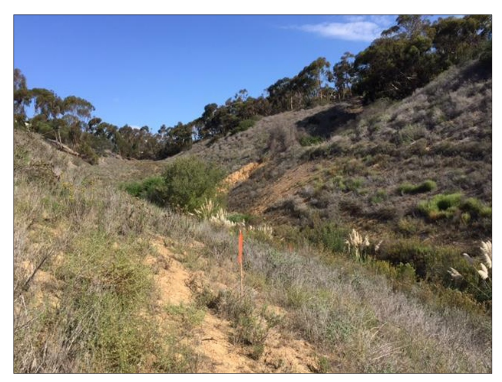
PRE-PROJECT Photo Point 4: View north towards deep incision on eastern slope. (October 20, 2015)