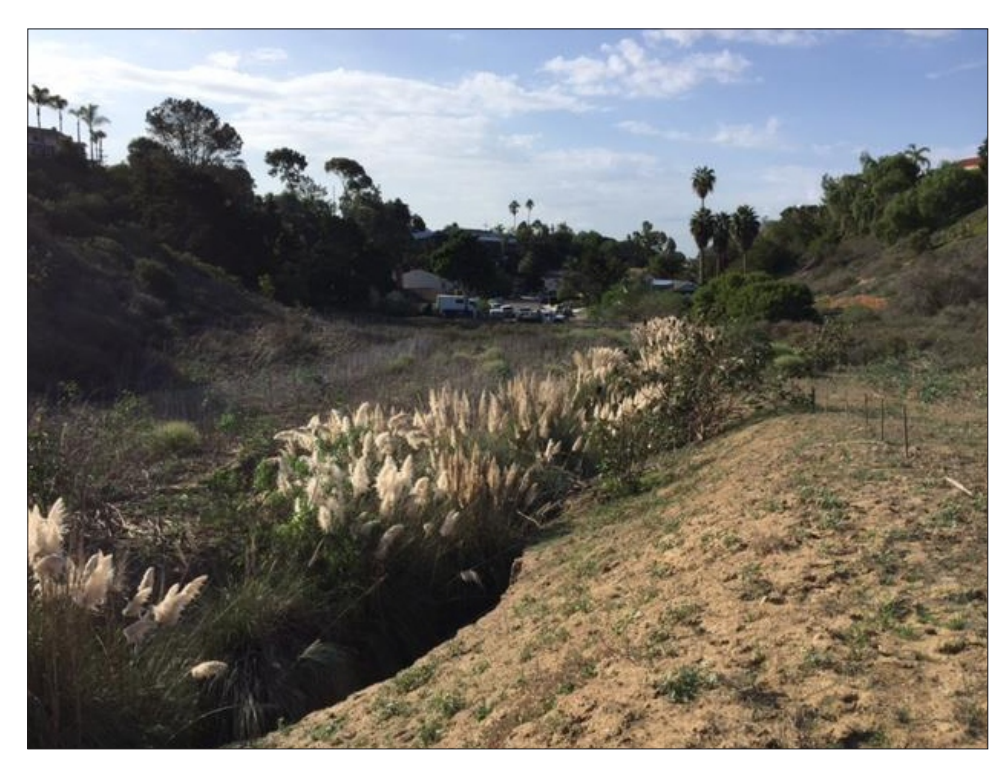
PRE-PROJECT Photo Point 2: View south of future detention basin location. (October 20, 2015)