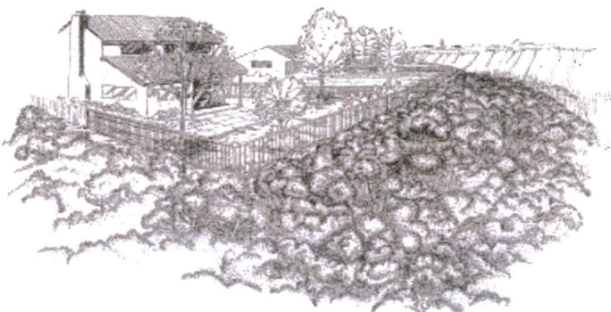
Before Brush Management

Check your local directory assistance or websites for potential landscapers or tree contractors. The Fire-Rescue Department cannot provide or recommend landscape or tree contractors. It is the responsibility of the property owner to assure all brush management work is conducted within the requirements of the City's Brush Management Regulation / City Landscape Regulation 142.042: http://docs.sandiego.gov/municode/MuniCodeChapter14/Ch14Art02Division04.pdf